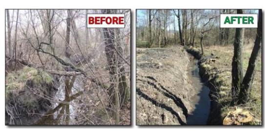
Figure 1. Example of maintenance work

rural areas with both plain and mountain landscape. A constant monitoring of the drainage network in rural areas with mountain landscape is difficult, due to isolation and complexity of the environment.